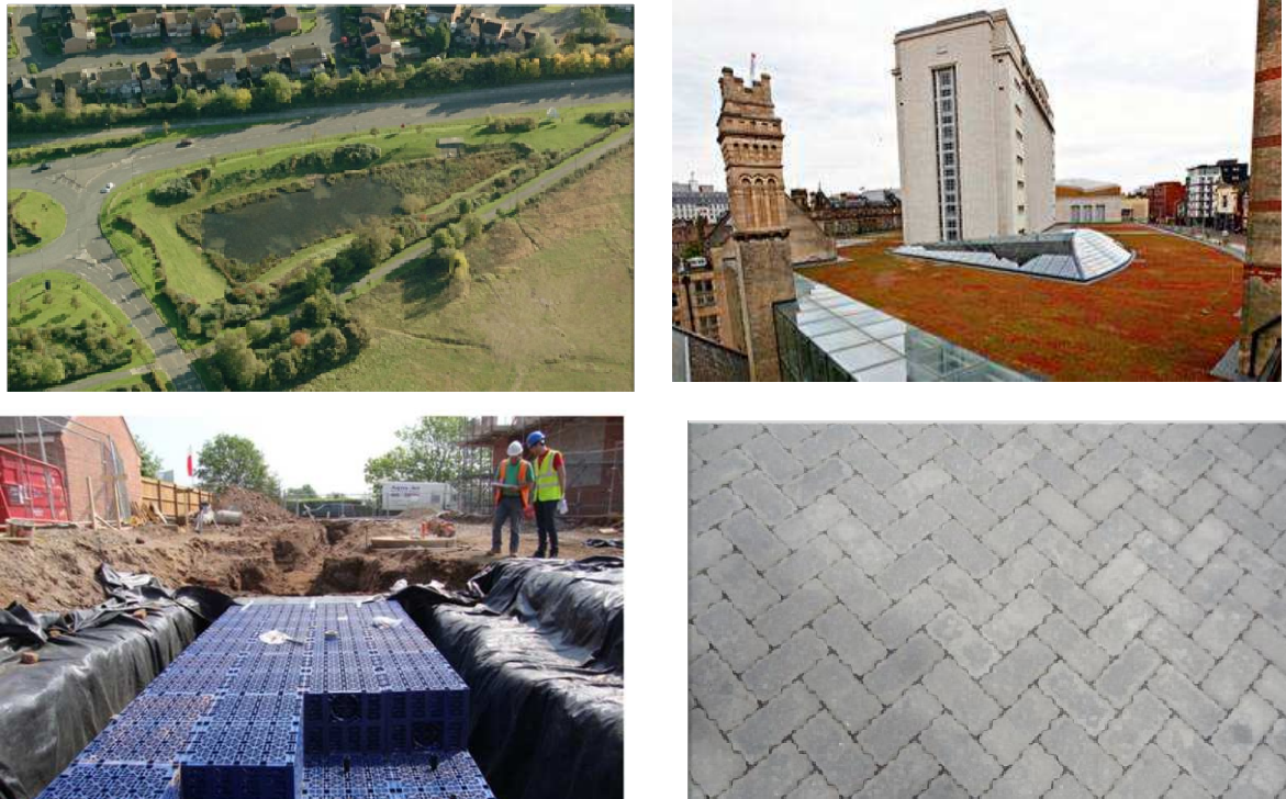
Figure 4-5: Examples of SuDS schemes that have been installed in Nottingham Top left: Attenuation basin at Nottingham Business Park; top right: green roof at Nottingham Trent University; bottom left: geocellular units at Ruddington Lane, bottom right: example of permeable paving

The legacy of using conventional piped drainage systems in new developments over many decades has resulted in numerous locations in the City that are vulnerable to flash flooding. Sustainable Drainage Systems ('SuDS') mimic natural processes and slow the flow of surface water following rainfall events. They also help to reduce pollution and improve wildlife habitat. Typical SuDS features include swales, permeable paving and attenuation ponds.