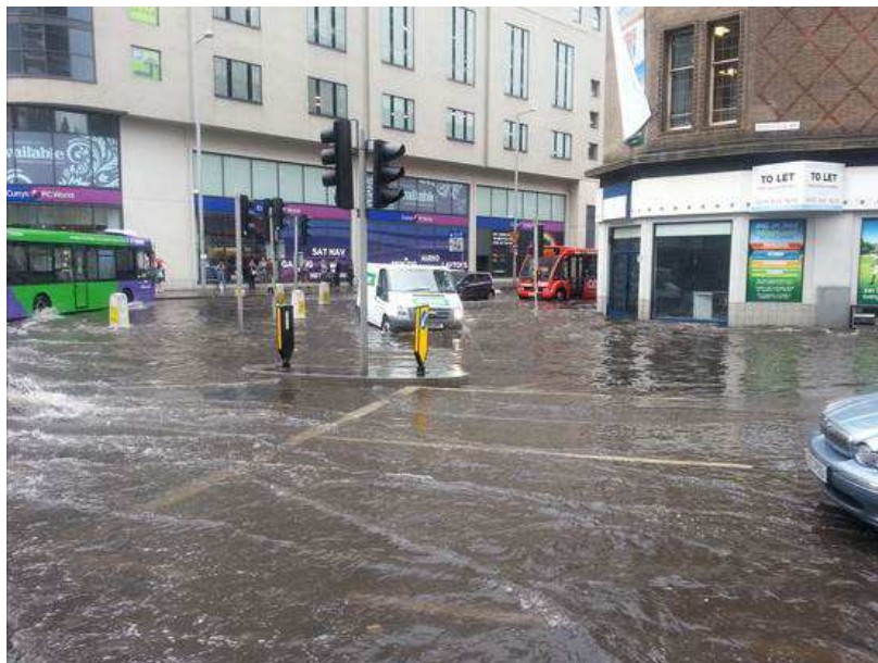
Figure 1-1: Flooding in Nottingham City Centre

There are many different measures that can be taken by individuals, communities and authorities to manage local flood risk and the associated impacts. These can include non-physical measures such as surveying, mapping and communicating risks or creating a flood plan for your home or business. Physical measures can also be implemented, such as removing blockages from watercourses, building flood defences or installing flood protection measures at your home.