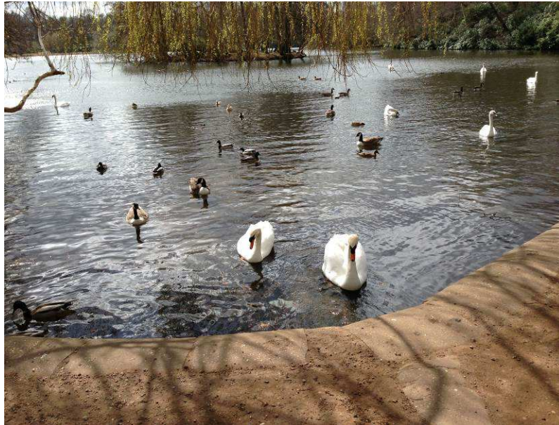
Figure 2-1: Wildlife at Wollaton Park Lake

The WFD aims to enhance and prevent deterioration of aquatic ecosystems, reduce water pollution, promote the sustainable use of water and reduce of groundwater pollution. In England, the Environment Agency is the competent authority for delivering all WFD objectives.