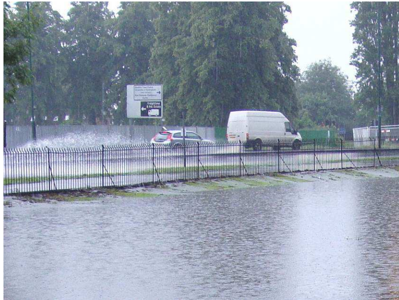
Figure 4-3: Surface water flooding at University Boulevard

Groundwater flooding relates to situations where land at or above the ground surface that is not normally covered by water becomes flooded by groundwater. Compared to rivers and surface water, groundwater levels respond more slowly to rainfall, river levels and abstraction activities. Since the decline in water-intensive industry, groundwater levels in Nottingham are recovering to natural levels. The City Council has had a number of reports of groundwater ingress into basements and cellars in areas such as Old Basford and Sneinton that have historically been dry. These properties were likely to have been built at a time when the groundwater table was artificially lowered by water-intensive industry that relied on abstracting groundwater to support operations. As a result of the decline in water-intensive industry, groundwater is rebounding to natural levels and consequently is entering below-ground voids. The water in cellars that is experienced by some residents is therefore a natural phenomenon. Artificially reducing the level of groundwater is an unsustainable option because the aquifer causing these issues is large and extends north to Doncaster. In the unlikely event that groundwater would rise above the surface of the land, the Council would be responsible for managing this flood risk.