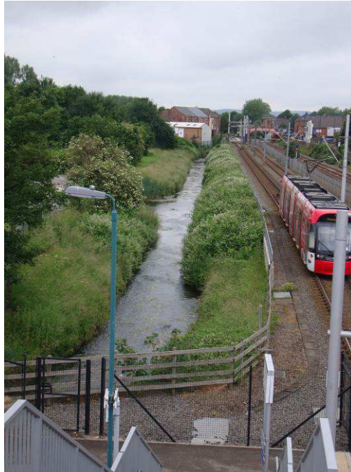
Figure 4-2: The River Leen at Basford Tram Station

Tottle Brook, Robins Wood Dyke and Tinkers Leen. Nottingham City Council is responsible for managing Ordinary Watercourse flood risk.